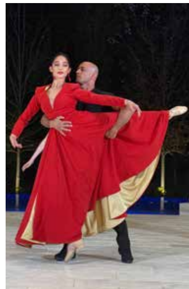
American Classical Ballet dancers