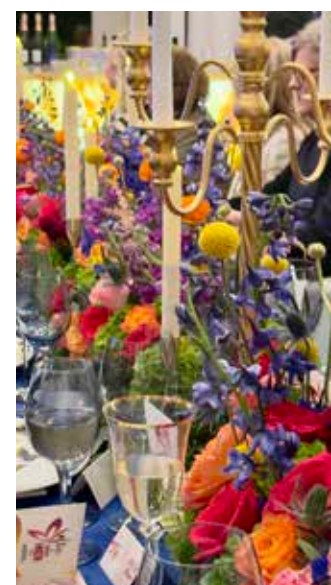
Impeccable florals by McShan Florist